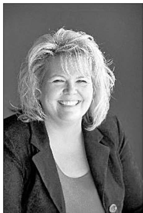
See Labeling, page 9

In fact, according to the Judicial Center for Courts, in 2009 over 110 million new lawsuits were filed in the United States. Every case has documents that need to be Bates labeled. When all of the other industries that utilize Bates numbering are taken into account, literally hundreds of billions