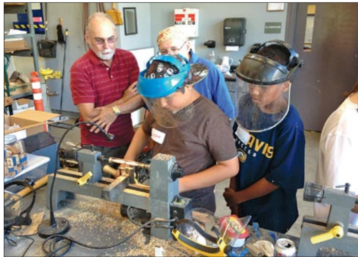
Students in the Youth Training Program of the Nor-Cal Woodturners.