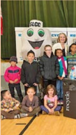
Whitney Ave. students recognized for recycling See page 2