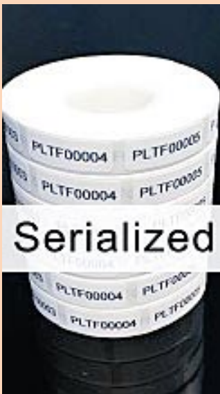
Carmichael entrepreneur starts new biz See page 8