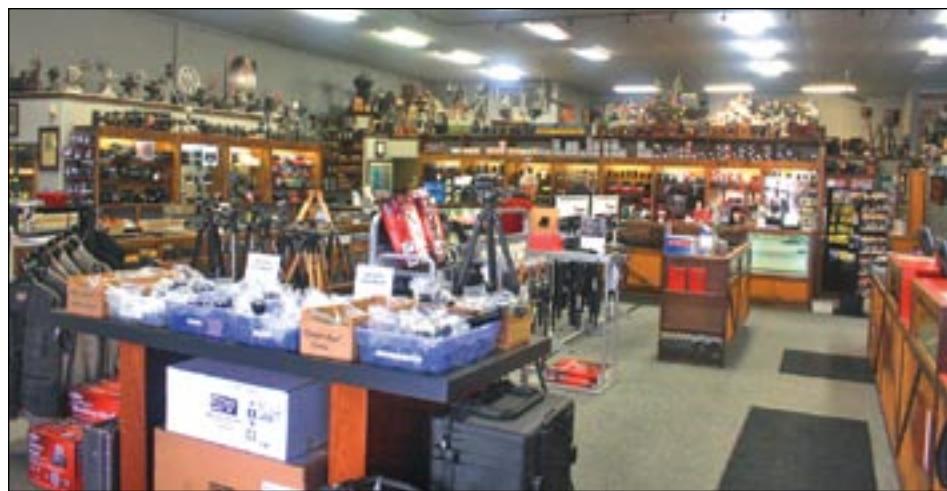
This recent photograph shows the interior of Pardee's Cameras, which carries a wide variety of cameras and accessories.