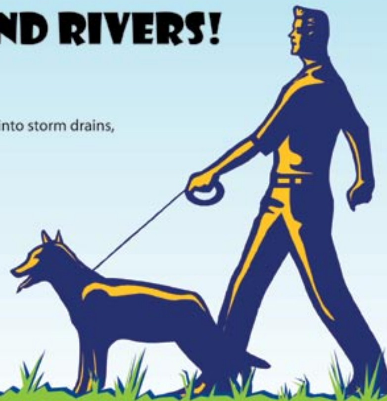
Man with dog—Clipart © Microsoft Media