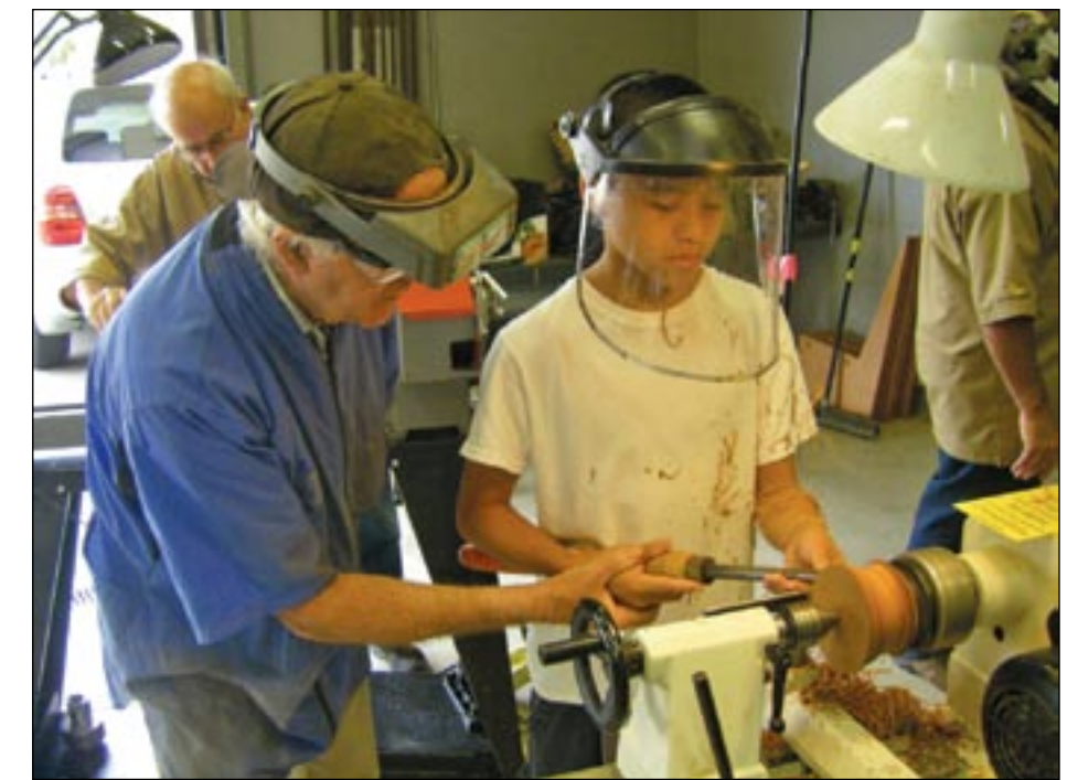
Students in the Youth Training Program of the Nor-Cal Woodturners.