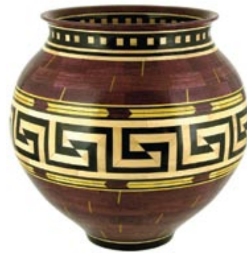
A woodturning by Nor-Cal Woodturners member Gene Kelly.