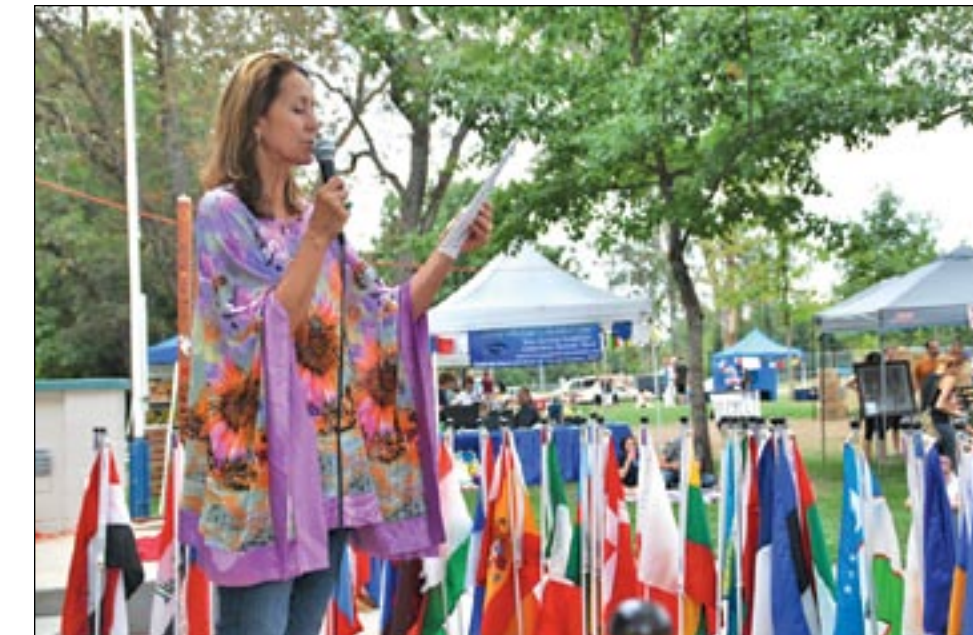
See Peace, page 12

Lining the stage after the flag ceremony, the flags provided a beautiful foreground for performers and speakers through out the day. Meanwhile, up on the stage, a towering peace pole stood alone. Built by David Flores of SAHA Yoga and Wellness Center, and painted by Debra Kahan and Ellen Springwind, the paint pole demonstrated