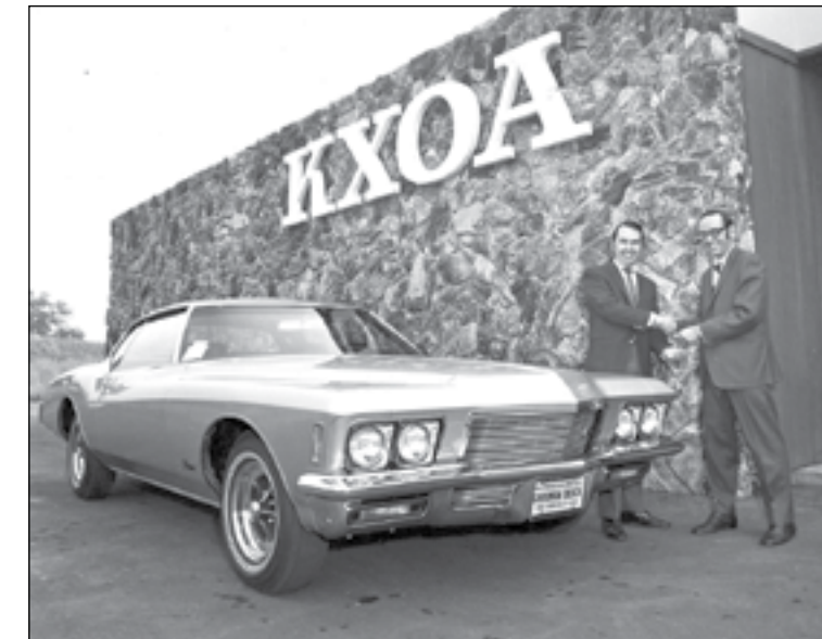
The KXOA building is shown in this vintage photograph. The radio station first aired on May 15, 1945.

In 1998, KXOA-FM made a switch on the radio dial from 107.9 FM to 93.7 FM,