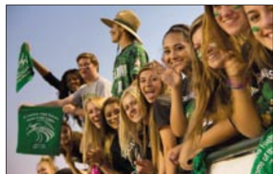
El Camino High School students show their school spirit at homecoming, whereby athletes got to experience a new playing field.

Across town at Del Campo High School, an equally large crowd cheered at the halftime of the Cougars' home opener as school offi-