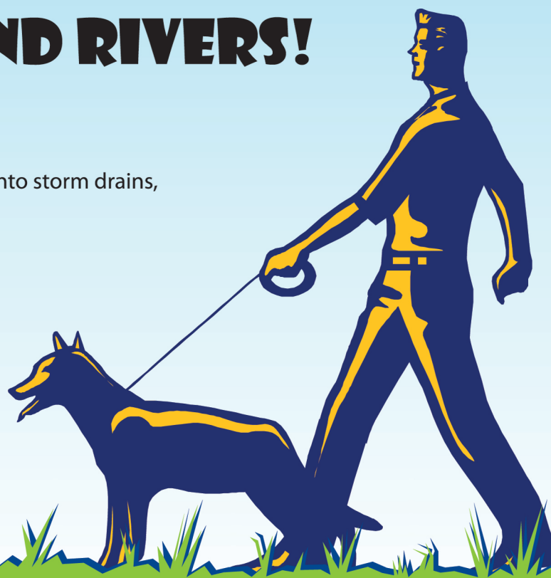
Man with dog—Clipart © Microsoft Media