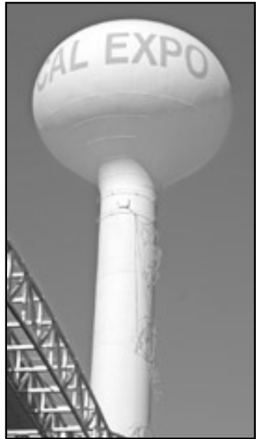
The Cal Expo water tower is a longtime iconic landmark of the fairgrounds.

Continue reading the Arden-Carmichael News for the latest on the land swap-Sacramento Kings arena deal involving Cal Expo, Arco Arena and the Sacramento downtown railyards.