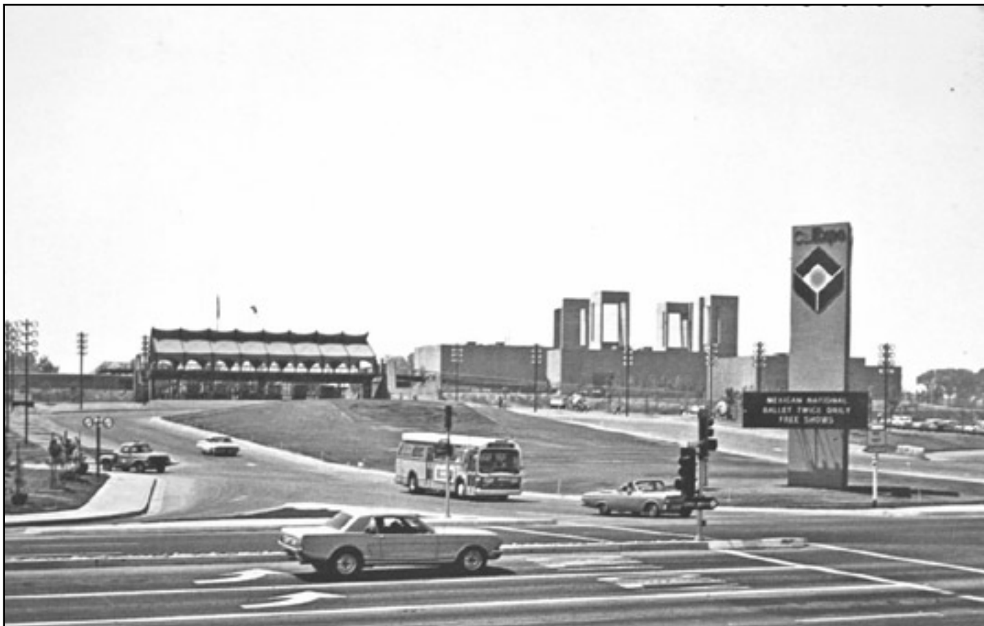
Cal Expo is shown in this photograph, taken in 1968, the year the State Fair was first held at this site.

It was not until the early 1960s, however, that funds were allocated and more specific planning began for the construction of the Cal Expo fair site, which would replace the Stockton Boulevard fair site, which opened in 1909.