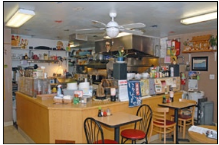
Japanese ramen delights are created in the kitchen of this tiny Curtis Park restaurant. Shoki Ramen House may well be one of the most unique ramen restaurants in the country.