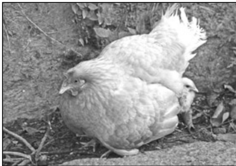
Photo courtesy A 1989 city law added chickens to a ban preventing livestock from being kept as pets, and a Sacramento County law made it illegal for urban homeowners to have chickens on their property unless they had more than 10,000 square feet of property.

"A lot of people who own chickens don't even know that it's against the law," Crouch said. "I think it's pretty ridiculous that people are allowed to have dogs and cats but not chickens. Dogs and cats don't put food on the table."