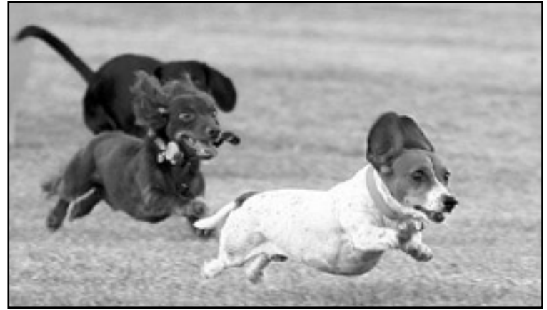
The thunder of tiny paws will be heard on July 17 at Cal Expo, when the California State Fair celebrates the 11th annual Dachshund Derby. Downtown Beans leads the pack. Maxwell von Crumpmeister trails in third by a tail.

Frank blew all the other dogs away that year, with his