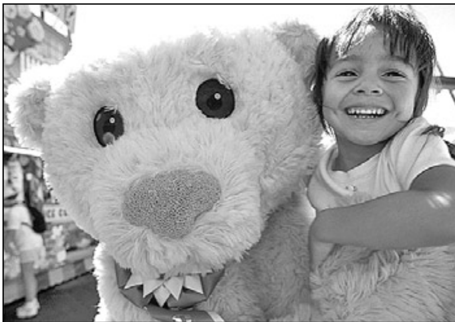
Poppy the Bear is the mascot of the California State Fair, and is a big hit with children of all ages.

Tickets can be purchased at www.bigfun.org .