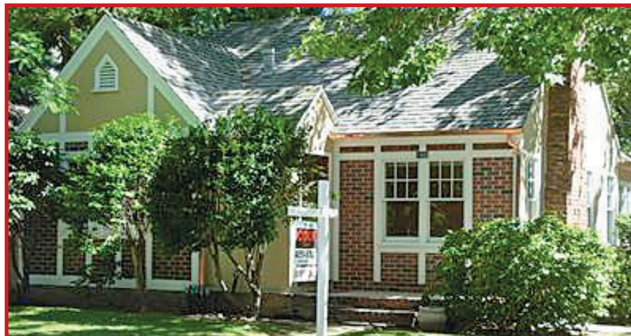
1000 VALLEJO WAY • $385,000 TAMMY NOVOA • 628-8530

See all our listings at www.cookrealty.net