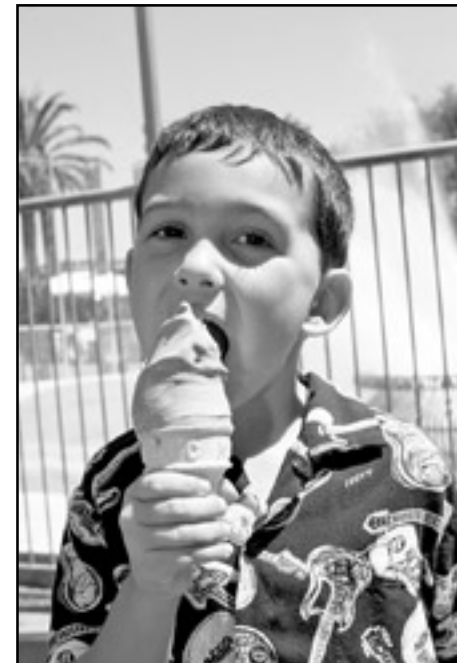
Big eats for less: Food and beverages will be discounted by 25 percent at this year's California State Fair.

The standard favorites are all there for those who love the fair: the agricultural exhibits, the farm animals, the racing horses and dachshunds, the arts and cultural exhibits, the rides on the Midway, the contests of skill, the vendors hawking amazing products and more. It may be wild, wacky and fun...but that's what summer fairs and family outings are for. This summer's California State Fair promises to make some wonderful memories. And that's priceless.