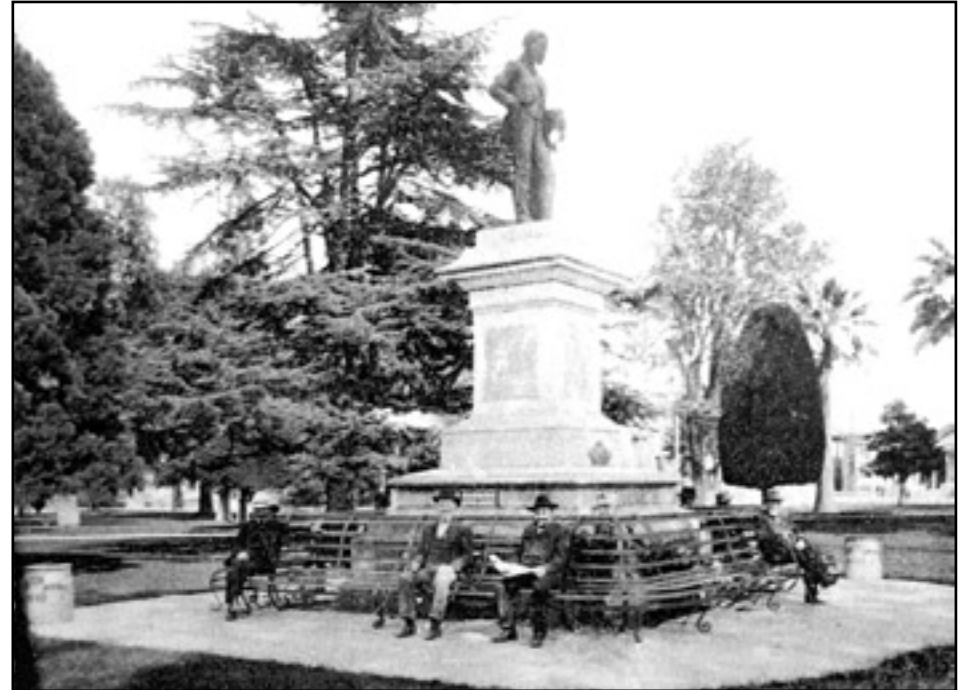
The 1889 Andrew Jackson Stevens Memorial, shown in this c. 1905 photograph at City Plaza – today's Cesar Chavez Plaza – is the city's oldest monument.

When the school was demolished many years ago, a park was built in its place.