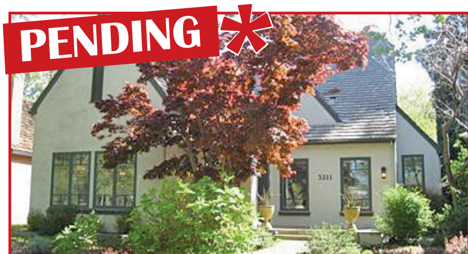
3211 EAST CURTIS DRIVE • $689,000 LARRY EASTERLING • 849-9431