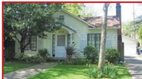
3212 CUTTER WAY Old Land Park Charmer. Sweet 2br with hardwood floors, central heat and air, and more. Put your own touches on this well located property. See for yourself. Usually open most weekends 1-4 or 2-5. $329,000 LARRY EASTERLING 849-9431