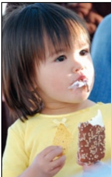
The annual Ice Cream Safari at the Sacramento Zoo is Saturday, July 24, from 4 to 8 p.m.

About the Sacramento Zoo Open since 1927, the Sacramento Zoo is home to over 450 native, rare and endangered animals and is one of over 200 accredited institutions of the Association of Zoos and Aquariums. Located near the corner of Land Park Drive and Sutterville Road in William Land Park, the Zoo is wholly managed by the non-profit Sacramento Zoological Society. This Sacramento treasure inspires conservation awareness through education and recreation. Open daily from 9:00 a.m. to 4:00 p.m., general admission is $11.00; children ages 3-12 are $7.00 and two and under are admitted free. Parking is free throughout the park or ride Regional Transit bus No. 6. For information, call 916-808-5888 or visit sac-zoo.com .