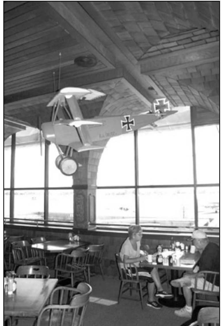
Aircraft, like the planes shown above, are a common visual for Aviators Restaurant diners.

"We live in the area and we love this restaurant," Tony said. "The food is good and the service is great and the prices are very reasonable. We used to come