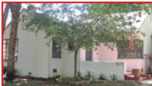
2640 14TH STREET Beautifully remodeled and updated home. Full kitchen remodel 2008 includes slab granite counters, stainless Bosch appliances. Bathrooms completely updated. Taste-ful use of hardwoods, granite floors & glassbrick. $395,000 CAROLYN CARR 712-3914