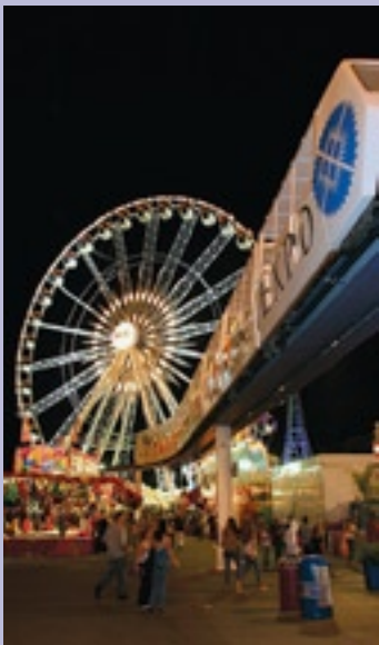
Big value, big fun at State Fair