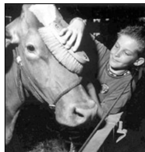
Kids and critters: The California State Fair highlights the state's number one industry: agriculture. Young people who are involved in programs such as 4-H and Future Farmers of America will show the animals they have raised this year at the fair.