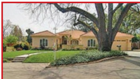
500 4TH AVENUE One of a kind custom gem. Tuscan design w/tall open archways. Dream kitchen cherry wood cabinets, 5 burner gas cook top, 2 ovens, pantry, granite counter tops, island & desk. $749,000 VICKIE HULBERT • 444-9973