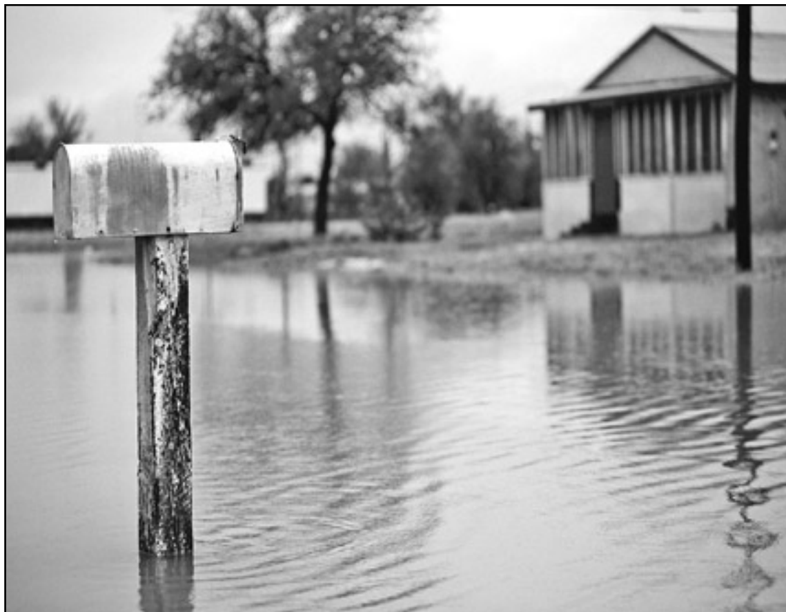
Meetings held throughout Sacramento will help residents continue to prepare for flooding emergencies.

Wednesday, Dec. 2 Location: Thomas Jefferson Elementary School Address: 2929 Belmar Street, Sacramento Meeting Time: 6:30 p.m.