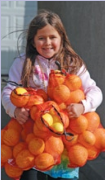
'Harvest Sacramento' seeks volunteers