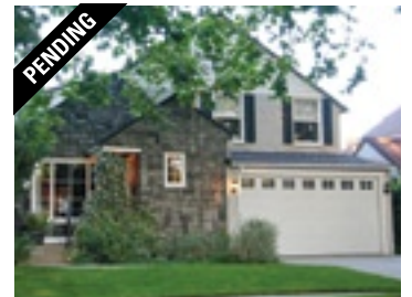
2775 18th Street $619,000 - 3 bedroom + guest house