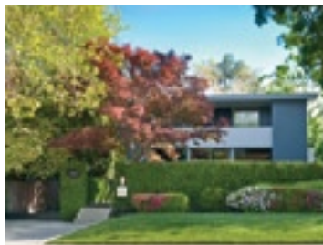
1891 11th Avenue $1,075,000 - Mid-Century Modern