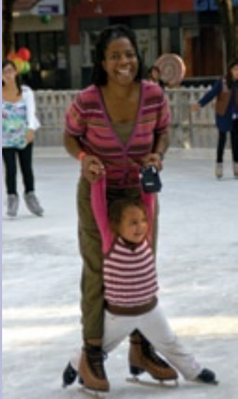
Outdoor ice skating in Sacramento