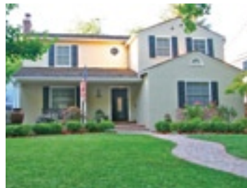
1049 11th Avenue $975,000 - On The Park