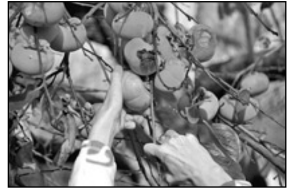
Volunteers from Harvest Sacramento will pick excess fruit from neighborhood backyards. The food is donated to local food banks.

Sacramento is essentially a food forest, sitting amid one of the largest urban citrus