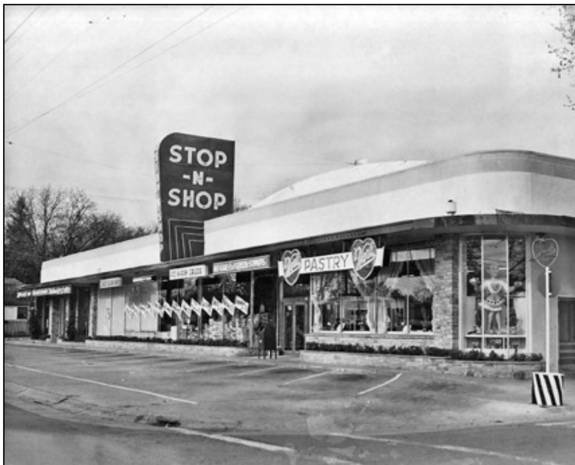
The Stop-N-Shop market at 3231 Riverside Blvd. served the community from 1947 to 1975. The building, which still exists today, was later home to Walter Kassis' Big K Market, which closed in 1982.

Furthermore, many longtime, local residents assuredly still remember the store's popular jingle, which featured the familiar lines: "Let's go down to the Stop-N-Shop and push the cart around 'n' round. Let's buy all of our groceries there. They have the best in town. Let's go down to the Stop-N-Shop and push the cart around 'n' round. You get a lot more for your money there than anywhere else in town."