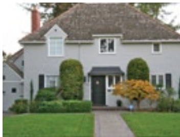
1170 Marian Way $679,900 - 3 bed, 2 ba, .20 acre lot