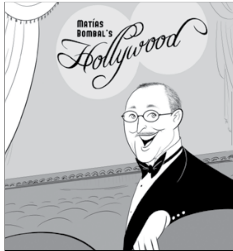
"This is Hollywood" Illustrated by Underwood Typewriter

Relativity Media offers a story of wonder for children of all ages and perhaps the E.T. of