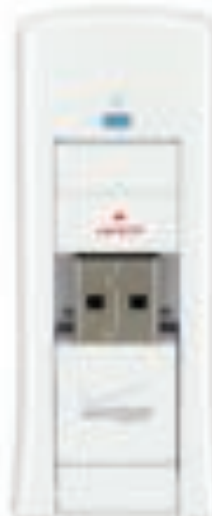
UM175 USB Modem

$49.99 2-year retail price - $50 mail-in rebate debit card With new 2-year activation.