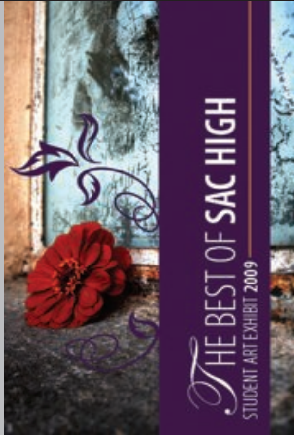
EXHIBIT SUPPORT PROVIDED BY:

www.stocktonblvdpartnership.com stocktonblvdpartnership@msn.com